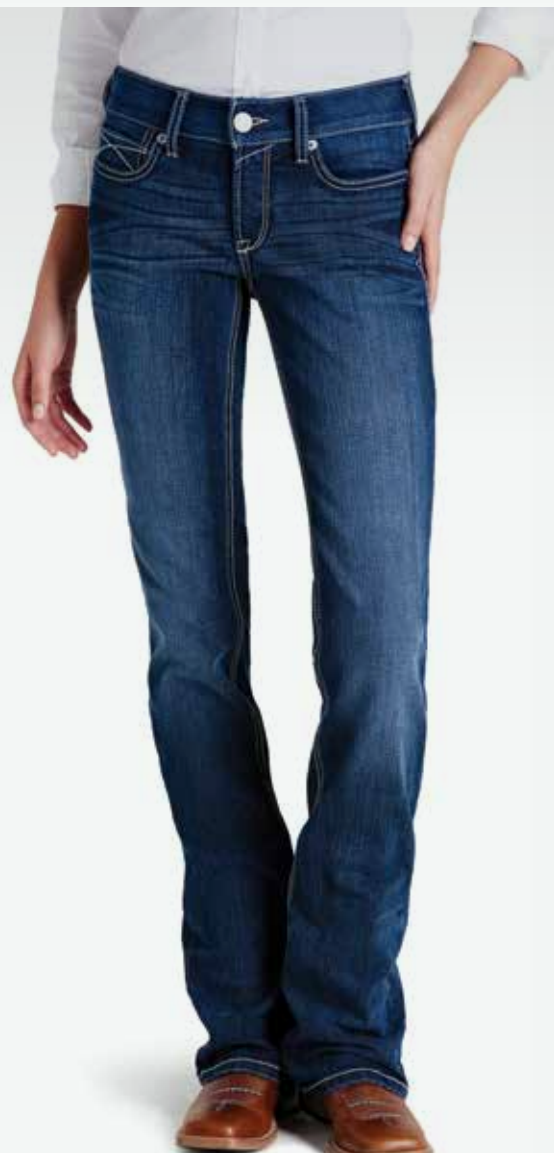
REAL BOOT CUT