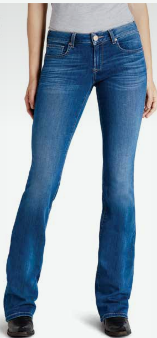
ULTRASTRETCH BOOT CUT