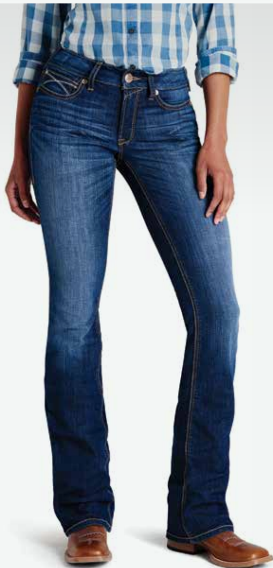
REAL BOOT CUT